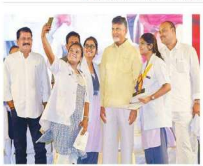
SVIMS students take a walk with CM Chandrababu Naidu in Tirupati on Saturday

Simultaneously published from Hyderabad | Warrangal | Tirup