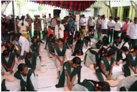
Students practicing CPR at Community CPR Programme organized at B.S.Kannan High School.