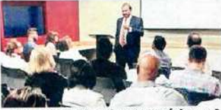
అమరావతి స్వీమ్స్ క్రెడెన్షియల్ రిజిస్ట్రేషన్ ప్రసంగం