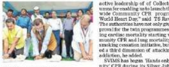
Chittoor District Collector launched the 'Heart Health' at BK Kanoni Government High School here on Saturday as part of the World Heart Day celebrations. The active leadership of Collector...