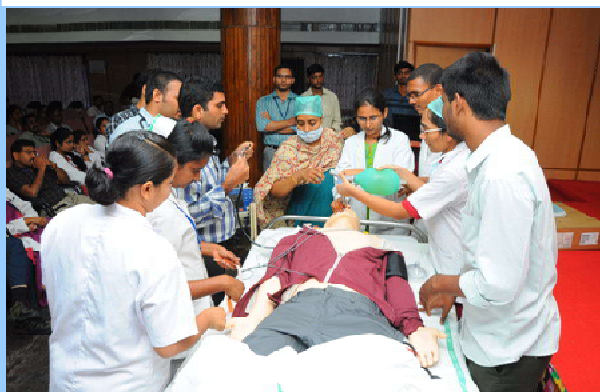
Workshop on simulation of a cardiac arrest patient in progress at SVIMS- Sri Padmavathi Auditorium on 19.09.2018.