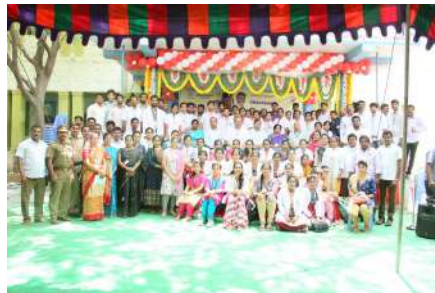
SVIMS CPR trainers after successfully conducting Community CPR Programme