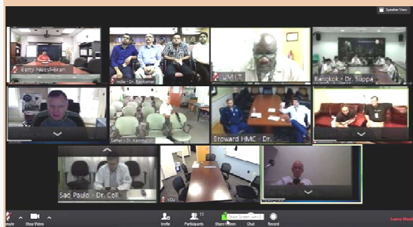
International Trauma Tele-Grand Rounds in progress on 29-06-2018

Doctors at SVIMS reached new heights in patient care and received international accolades for effectively managing a seven year old boy who sustained severe injuries due to a road accident on 20/05/2018. With the inception of triage system two years