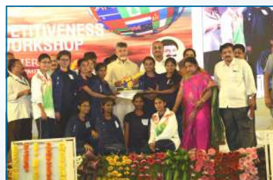
SVIMS Womens Volley Ball team receiving prize from Sri. Nara Chandrababu Naidu garu, Hon'ble Chief Minister of Andhra Pradesh at Jnana Bheri Programme. SVIMS Womens Volley Ball team were the runners at the Volley Ball Finals held at Jnana Bheri.