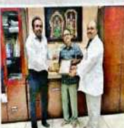
ఎన్టీఆర్ వైద్యసేవ ఉత్తమ అవార్డు ప్రదానం