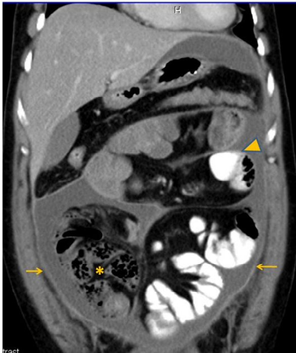
Figure 2: Coronal CECT showing thin soft tissue density membrane encasing small bowel loops in midline giving the appearance of cocoon (arrow), few dilated small bowel loops within, dilated distal ileal loop showing thinned out wall with intramural air and small bowel faeces sign (asterisk), loculated fluid surrounding loops within cocoon (arrow head)