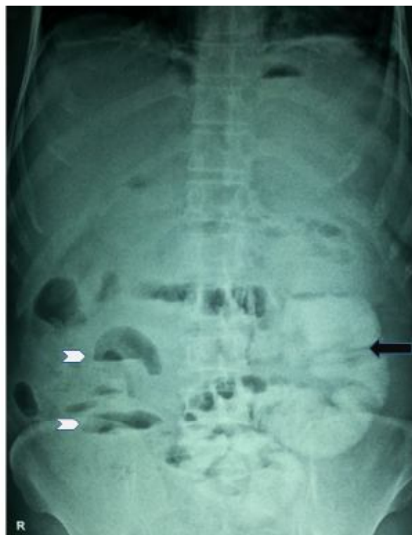
Figure 1: Erect plain radiograph of abdomen showing dilated small bowel loops in left lower quadrant (arrow) and multiple air fluid levels in right iliac fossa (arrow heads)

Histopathological examination of the excised peritoneal capsule showed proliferation of the fibroconnective tissue with signs of non-specific inflammatory reaction and no signs of tuberculosis/malignancy (Figure 4), suggestive of SEP. Histopathology of excised gangrenous bowel suggested acute ischaemic pathology.