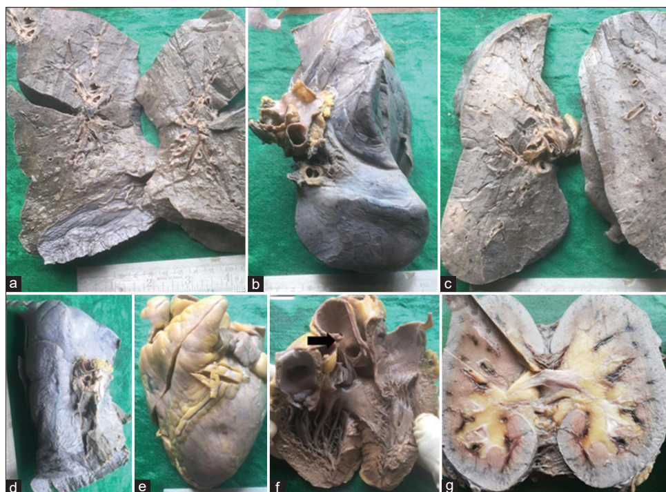
Figure 1: Gross specimen photographs (a-d) external surface and cut - section of the lung in case 1 showing pulmonary oedema. External surface (e) and cut section of heart (f) showing atherosclerotic changes in the aorta (arrow) in case 2. Cut-section of kidneys of case 6 showing oedema and haemorrhages at the corticomedullary junction, microscopy revealed acute tubular necrosis (g)