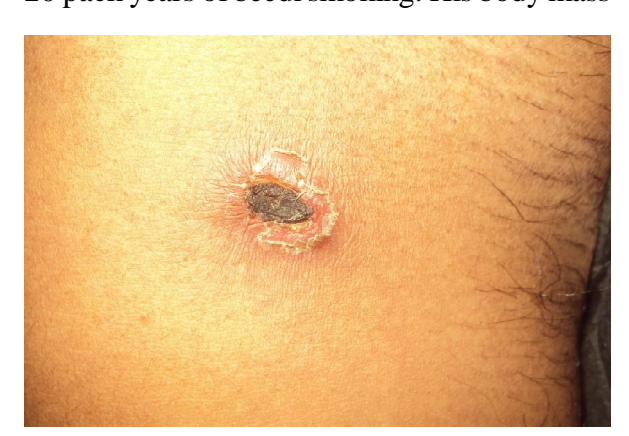
Figure 1: Typical lesion with eschar and surrounding erythema seen on the 8<sup>th</sup> day

Ten years earlier, he underwent orchidectomy on right side, was diagnosed to have seminoma testis and had received radiotherapy for the same. There was history of ethanol abuse and 20 pack years of beedi smoking. His body mass