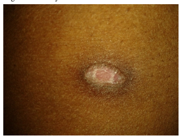
Figure 4: The skin lesion at 6 weeks

index was 21.4 kg/m<sup>2</sup>. Other vital data were within normal limits.