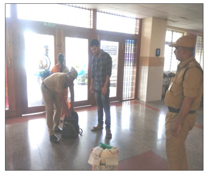
Commencement of searching process from all entrance & exit points

NO BABY ABDUCTION / MISIDENTIFICATION TILL DATE AT SVIMS