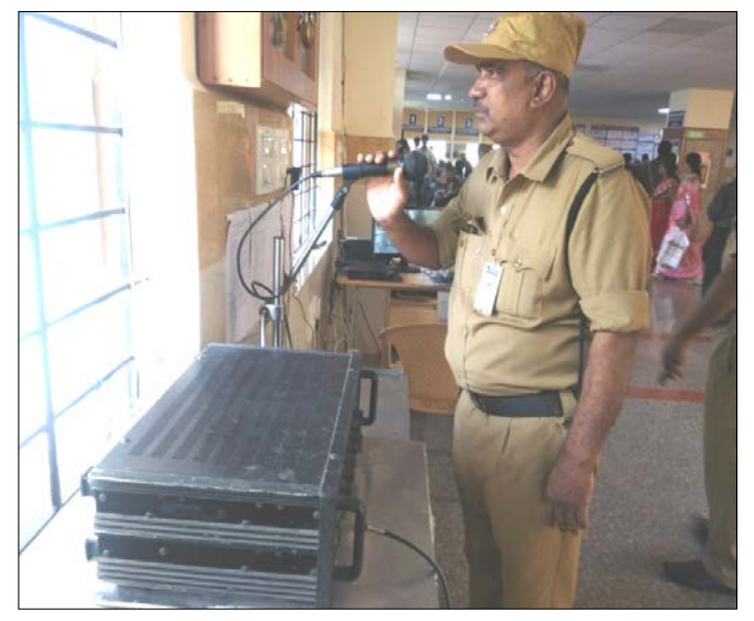
Alerting about CODE PINK though Public Addressing System