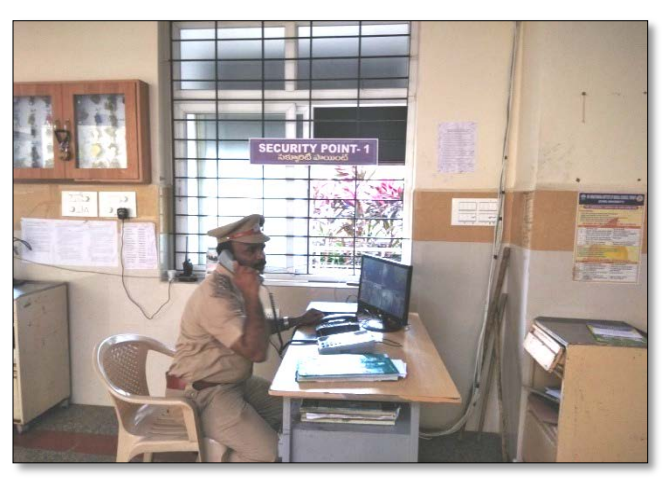
Main gate Security receiving call about CODE PINK