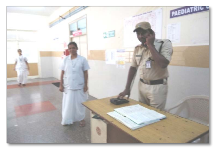
Ward sister & Security alerting about CODE PINK to Main gate Security