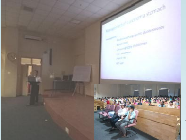
Integrated teaching program in progress in SVIMS-SPMCW