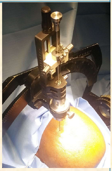
Deep Brain Stimulation procedure

SVIMS Neurosciences launched holistic approach for movement disorders and DBS in July 2017. Since then twenty patients suffering from various movement disorders benefitted from DBS procedure at SVIMS.