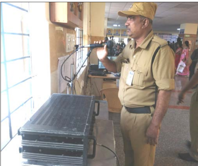
Alerting about CODE PINK though Public Addressing System