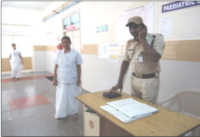
Ward sister & Security alerting about CODE PINK to Main gate Security