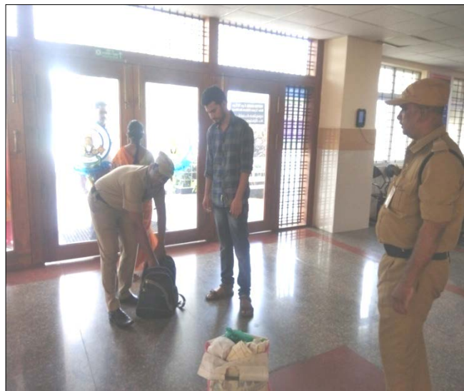
Commencement of searching process from all entrance & exit points

NO BABY ABDUCTION / MISIDENTIFICATION TILL DATE AT SVIMS