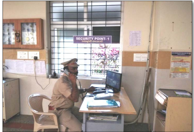
Main gate Security receiving call about CODE PINK